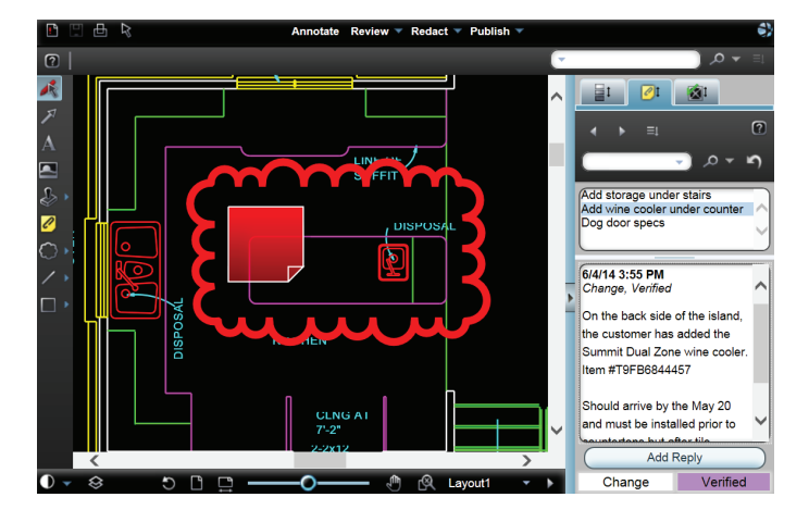
Changemark threaded discussions record all comments